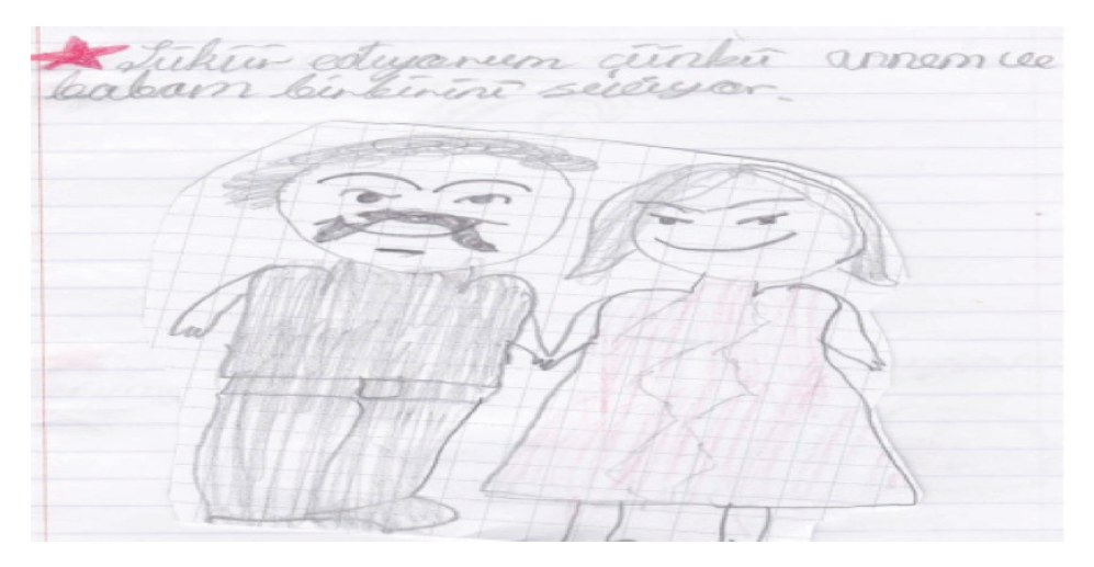
Figure 3. A picture taken from the diary of a child (Girl #5). "I am grateful to God that my mother and father loves each other."

members; their school, teachers and friends; being alive (e.g. happiness, peace, waking up to a good day); being Muslim (e.g. being present at religious rituals and holidays, going to mosques, knowing the Prophet, reading the Holy Book); and being healthy (e.g., having hands, eyes, feet, and not being disabled or suffering from any disorders or illnesses). Likewise, the results of this study indicate that children are mostly grateful for their family, friends, and basic needs (see Table 1).