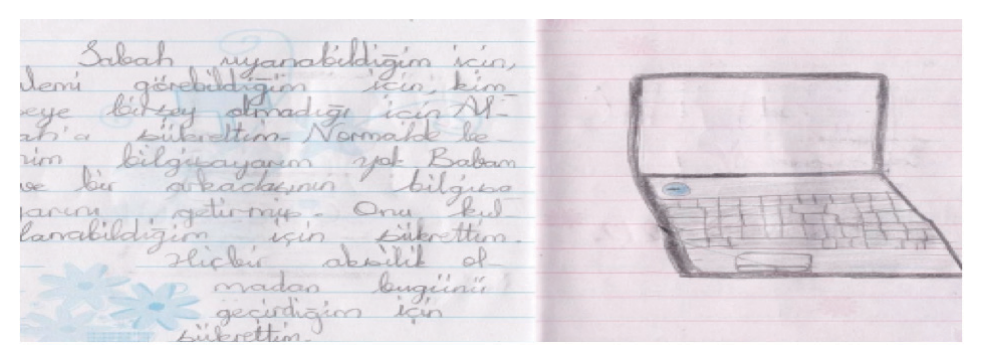
Figure 2. A picture taken from the diary of a child (Girl #59). "I thank God because I have a computer."

I am grateful to be able to see, hear, and talk. (Girl #3)