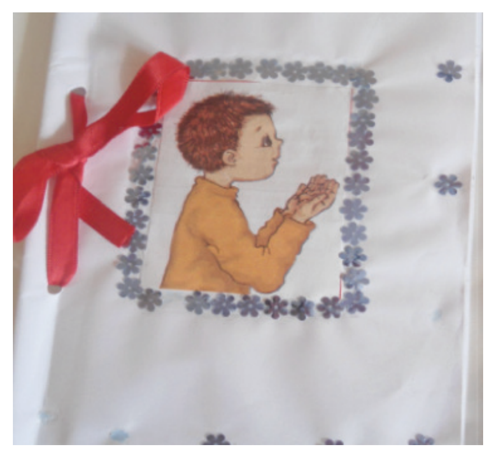
Figure 4. A picture taken from the diary of a child. (Boy #46).

While writing this diary, I realized that God loves me very much because I thought and realized that God has given us very many blessings. I love God veeerrryy much... (Boy #1)