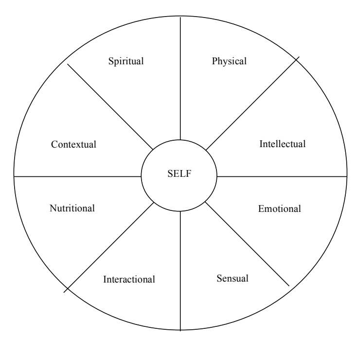
Figure 2. The self-mandala (Satir, 2008, as cited in Piddocke, 2010, p. 139).

The self-mandala and its dimensions. Satir also used a mandala of eight parts covering health to represent the self. These dimensions are not independent of each other; on the contrary, they interact with each other. The segments that correspond to dimensions are explained in terms of the substance and context of Satir's views (see Figure 2; Satir, 1988, 2008).